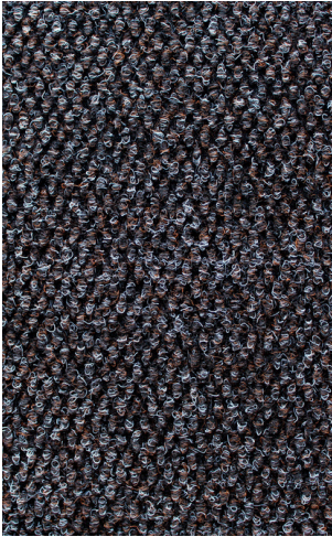
Duronop Tobacco SPD-DU-97 3' x 5' 5 6' x 4' 10