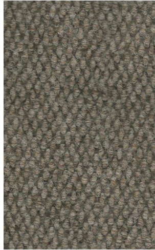
Duronop Beige SPD-DU-153 3' x 5' 10 6' x 4' 5