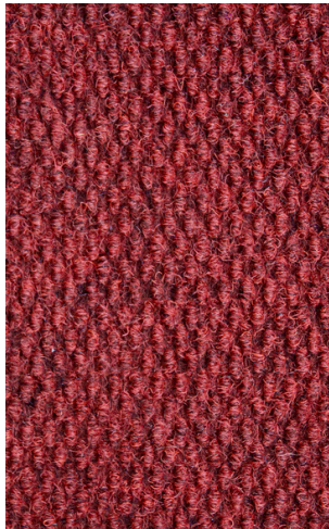
Duronop Red SPD-DU-353 3' x 5' 3 6' x 4' 5

First come, First serve subject to prior sale