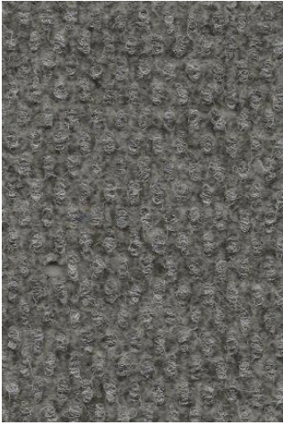
Earth Tile Steel Grey SPDT-ET2225 81.6 SY / 734 SF