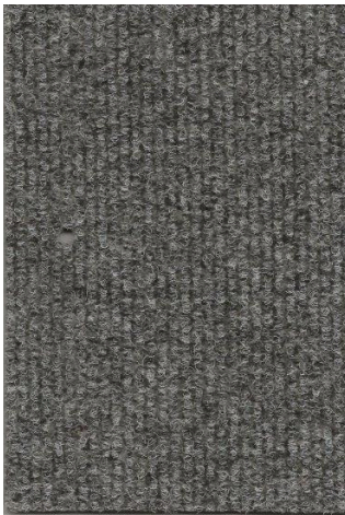
Fire Tile Winter Grey SPDT-FT2225 57.6 SY / 518 SF