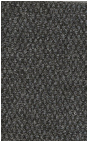
Duronop Steel SPD-DU-531 3' x 5' 8 6' x 4' 7